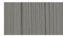
Vinyl Shakes: Charcoal