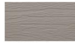
Vinyl Siding: Stonecrest