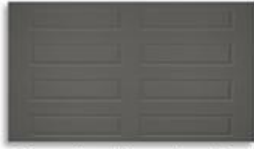
Garage Door: Bronze Long Panel