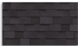
Shingles: Dual Black