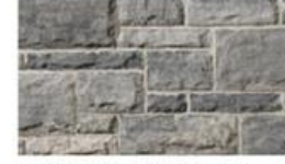
Stone: Artiste Marble Grey