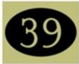
Address Stone: 10x12 Standard