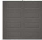
Bronze garage door colour