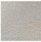
Gull Grey stucco