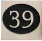
Address stone above garage