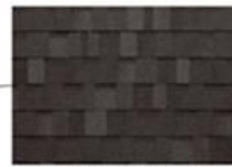
Dual Black shingles