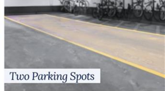
Two Parking Spots